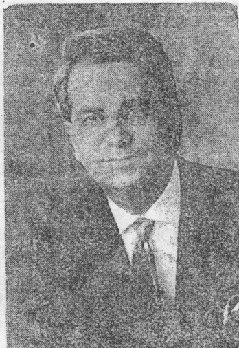
Charismatic Leader Benny Hinn