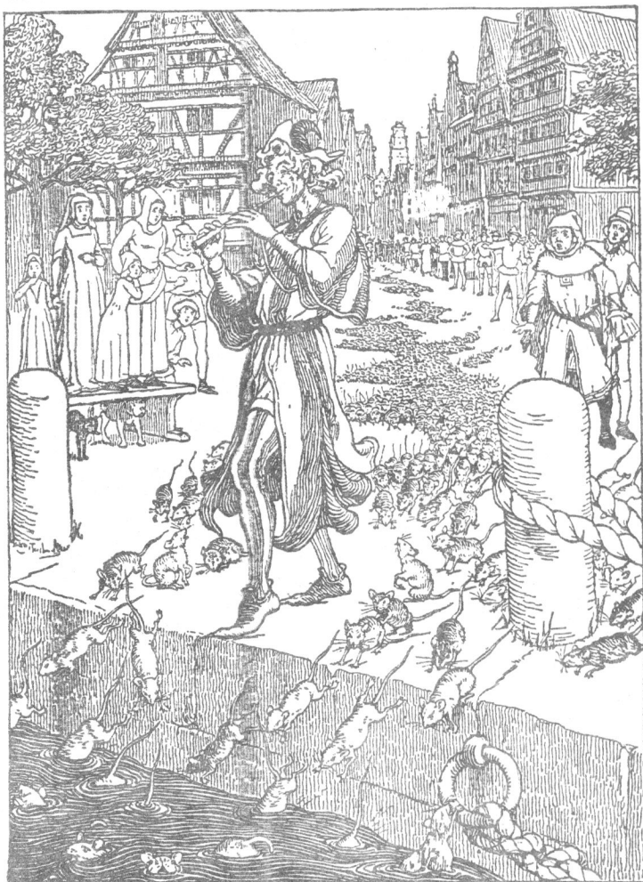
THE PIED PIPER

THOSE WHO BUY 5 CASES (48 of the ORIGINAL 1884 "GREAT CONTROVERSIES!" $120.00 EACH CASE TO ANY PLACE IN THE WORLD PLUS POSTAGE AND INSURANCE) - will get 6th CASE - FREE!