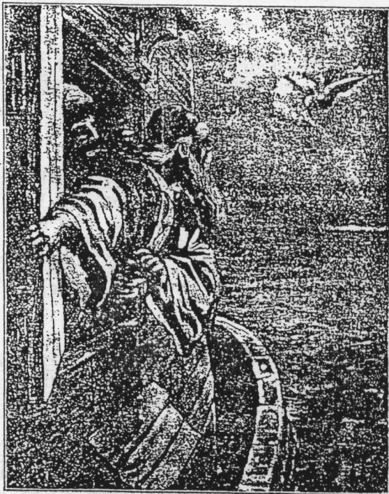
THE DOVE CAME BACK TO THE ARK.