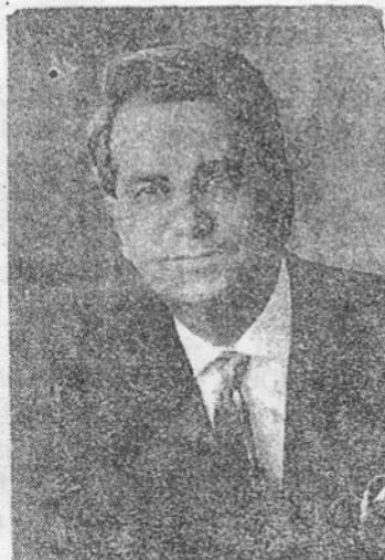
Charismatic Leader Benny Hinn