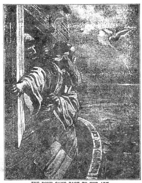
THE DOVE CAME BACK TO THE ARK.