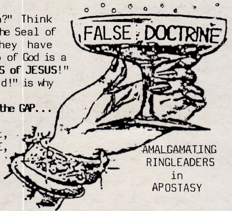
AMALGAMATING RINGLEADERS in APOSTASY

"The CHURCH being endowed with the Righteousness of Christ, is His DEPOSITORY in which the Wealth of His MERCY , His LOVE , His GRACE is to APPEAR in FULL & Final DISPLAY ...the GIFT of His HOLY SPIRIT , rich, full & abundant, IS TO BE to His CHURCH as an ENCOMPASSING WALL OF FIRE , which the "P POWERS of HELL shall NOT PREVAIL AGAINST ." TM 18. The REMNANT FOLLOW Jesus INTO the MOST HOLY PLACE .